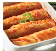
Bean-Stuffed Cabbage Rolls