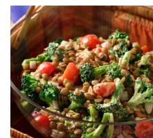
Broccoli Lentil Salad with Tumeric Yogurt Dressing