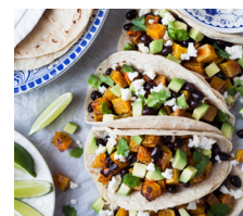
Avocado, Roasted Squash and Black Bean Tacos