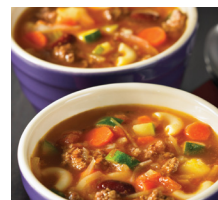
Hearty Beef Minestrone